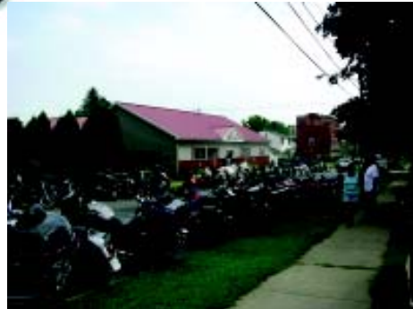
Bikes line up on both sides of Lower Main Street in Schaghticoke.