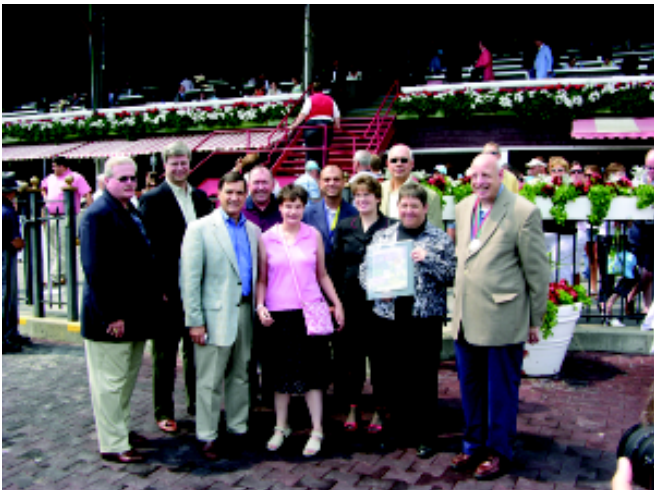
A winning crowd in the Winners circle.