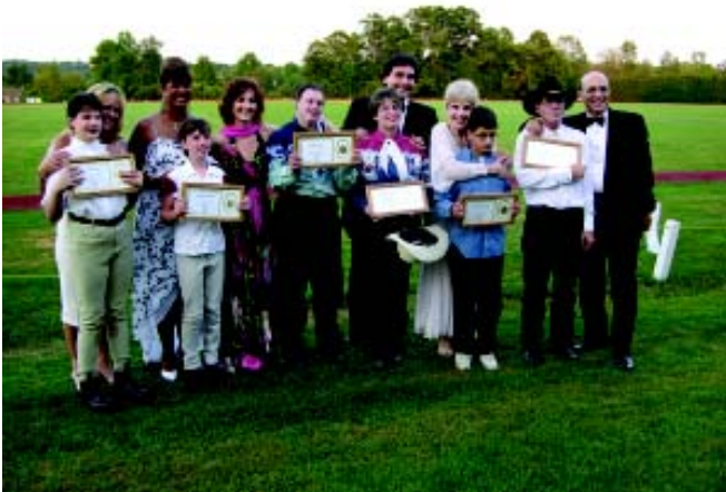
SONY Equestrian athletes pose for a picture with the stars at the 15 th Annual Satins, Silks & Stars Gala.