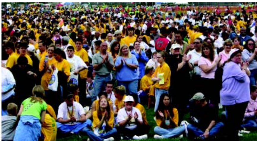
Volunteers and family members at the 2005 Long Island Spring Games.

population. Most importantly, volunteers and staff want to ensure a safe environment for all Special Olympics athletes. The organization would also like to stress that all information collected will remain confidential. We understand that there will be some adjusting to this new procedure, but ultimately it will best serve the most important group we're all here for – our athletes. ■