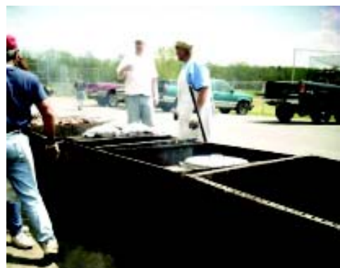
The man in the yellow baseball cap is Police Chief David Buck, of the Village of Groton