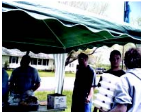
About 50 volunteers pitched in to make the barbecue a success and they raised money for SONY athletes along the way!