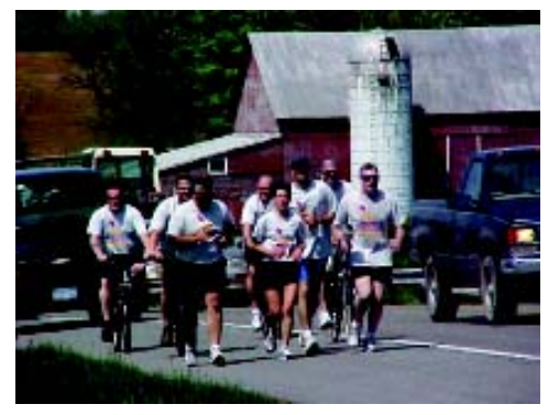
Finger Lakes – The Torch began its 66-mile Central New York journey in the wee hours of the morning in Canandaigua, NY. Law Enforcement agencies from all over Central New York joined in to carry the Torch all the way into the Party in the Plaza in the city of Syracuse.