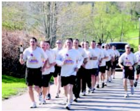
York Games – A long standing Torch Run in the Genesee Region, Law Enforcement Officers lead the Torch right into the York Games.