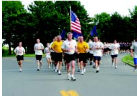
The Final Leg – Capital Region Law Enforcement along with representatives from both the New York State Police and New York State Department of Corrections carried the Torch on the Final Leg.