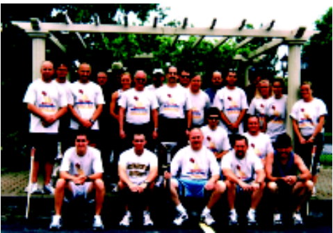
With Law Enforcement from all agencies involved the Torch made its way from the Adirondacks down Route 9 through Lake George, Glens Falls and on to Mechanicville.