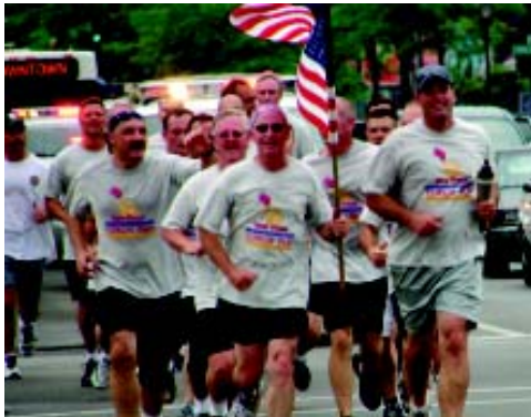
WNY – On June 1st, Law Enforcement from the New York State Police, Amherst, Tonawanda, Kenmore, Canisius College and the city of Buffalo ran throughout WNY.